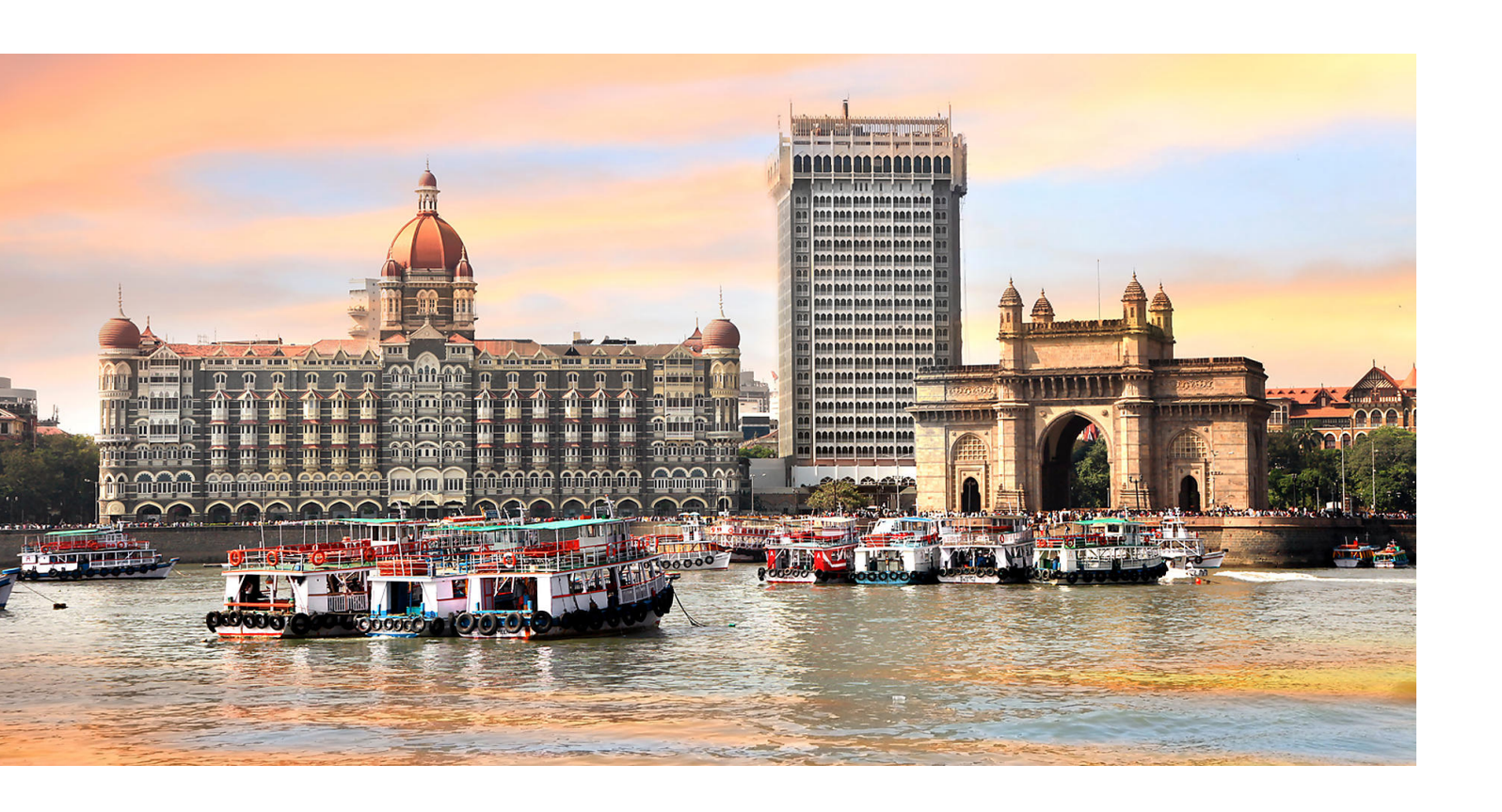
The information in this document is valid as of 5/3/2021