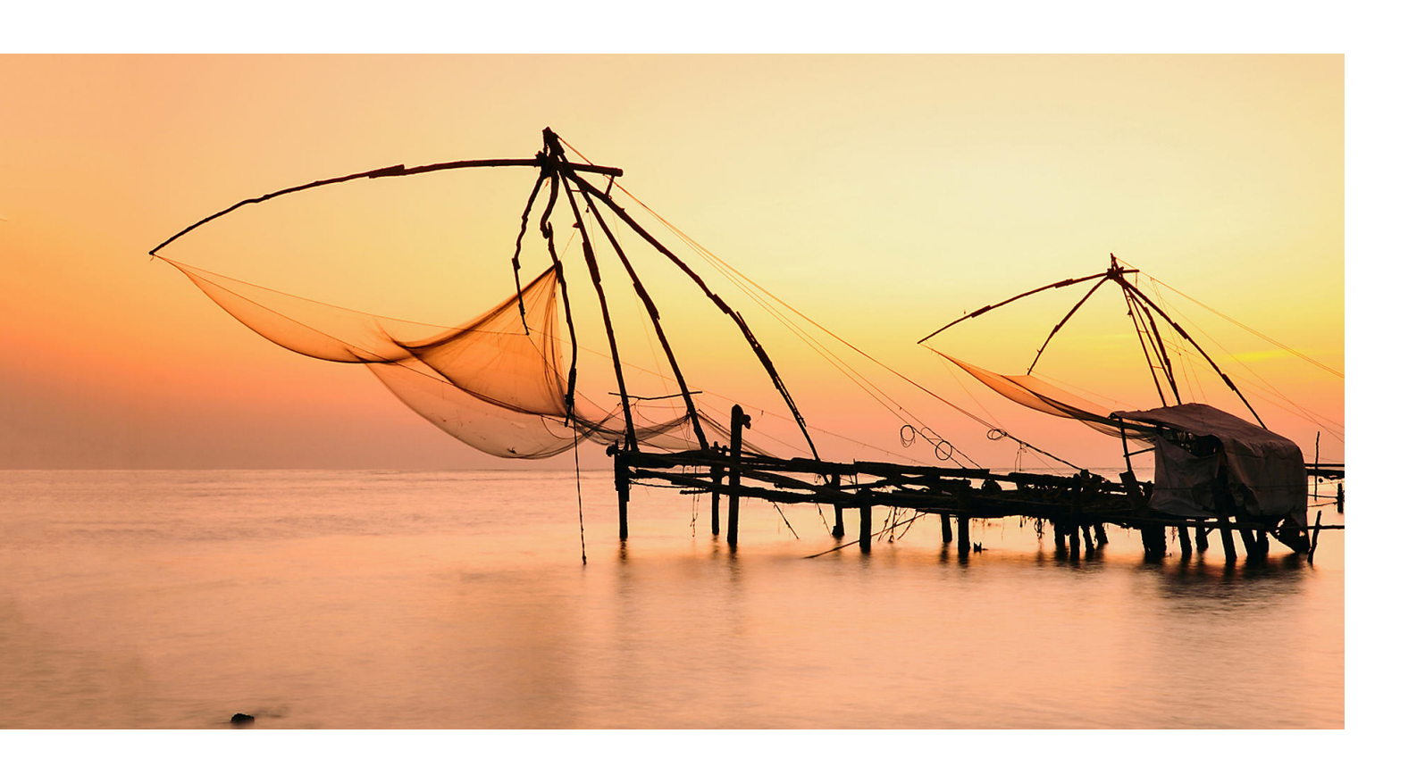
The information in this document is valid as of 5/3/2021