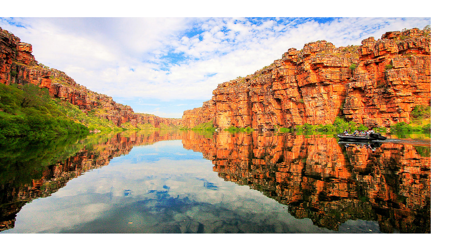
The information in this document is valid as of 17/2/2021